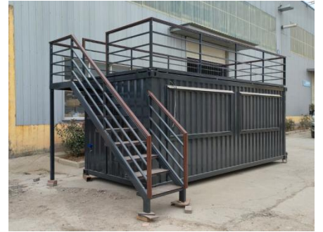
- Stairs -