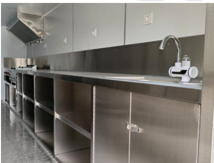
- Equipment -