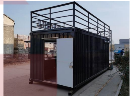
- Door -