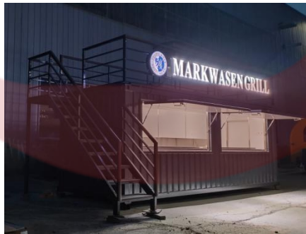
- Light -