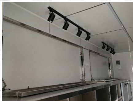
- Concession Windows -