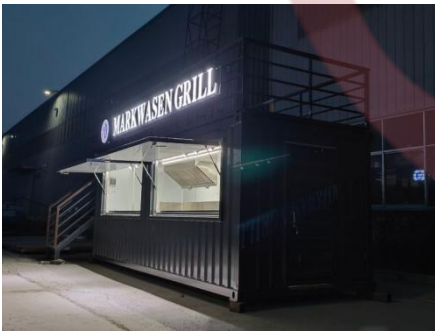
- Light -