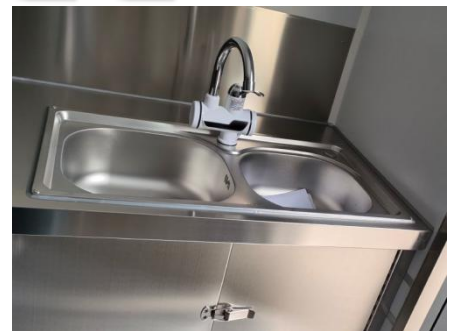
- Sinks -